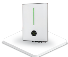
AC Coupled Inverter