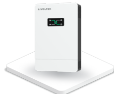
Off-grid Hybrid Inverter