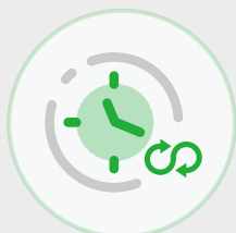
Long Cycle Life