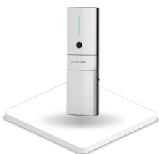
All-in-one Energy Storage System