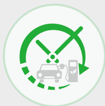
Time of Use Tariff